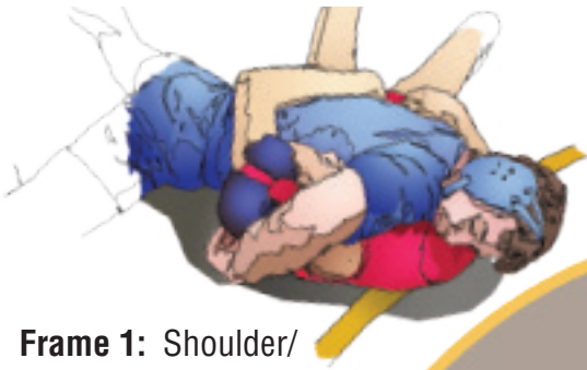
Frame 1: Shoulder/ scapula on line near fall/fall shall be counted